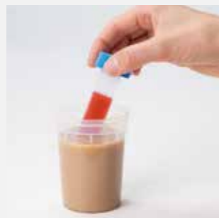
Dip or swab