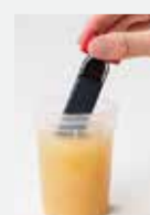
Dip, press or swab